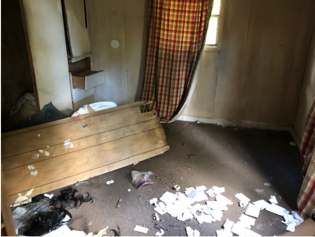
This photo depicts the bedroom.