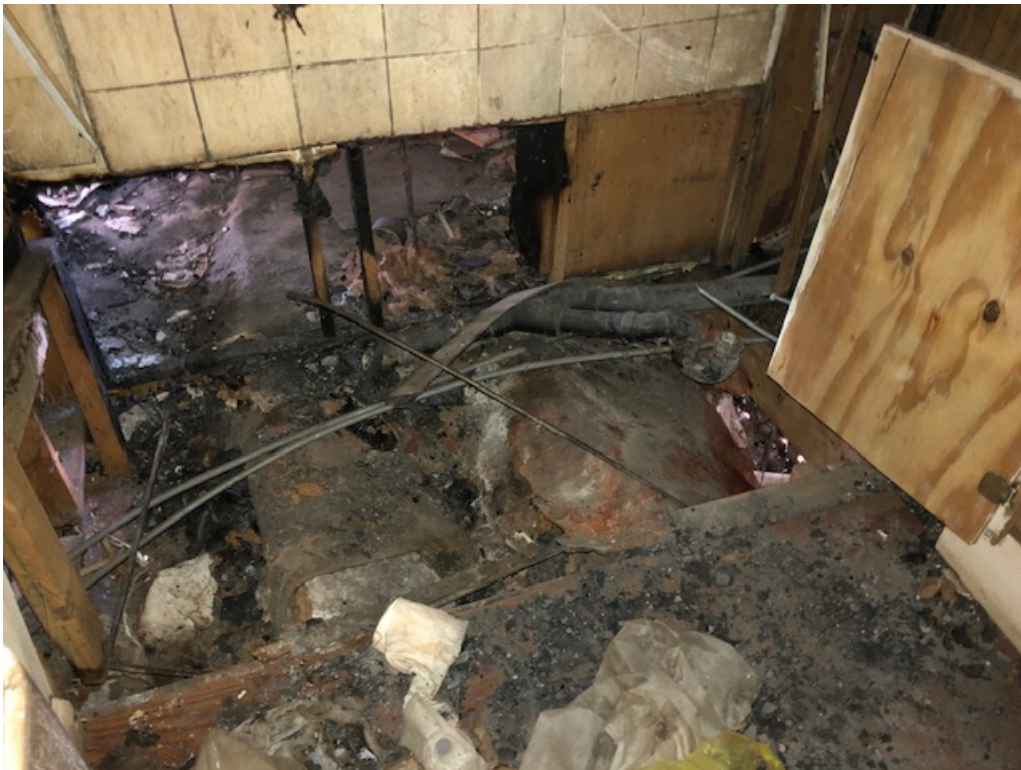
This photo depicts the flooring sampled from the bathroom.