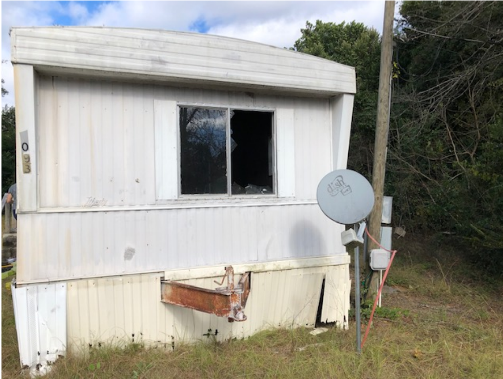
This photo depicts the front of the structure.