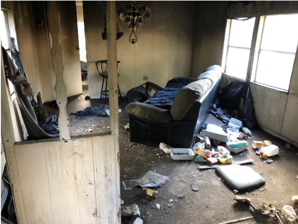
This photo depicts the living room.