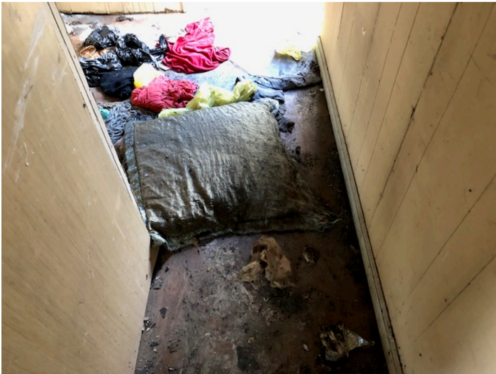
This photo depicts the flooring in the hallway.