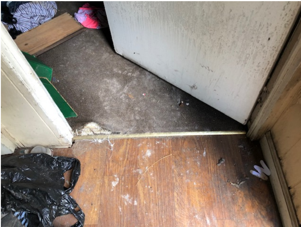
This photo depicts the area of the bedroom where sheet flooring was sampled.