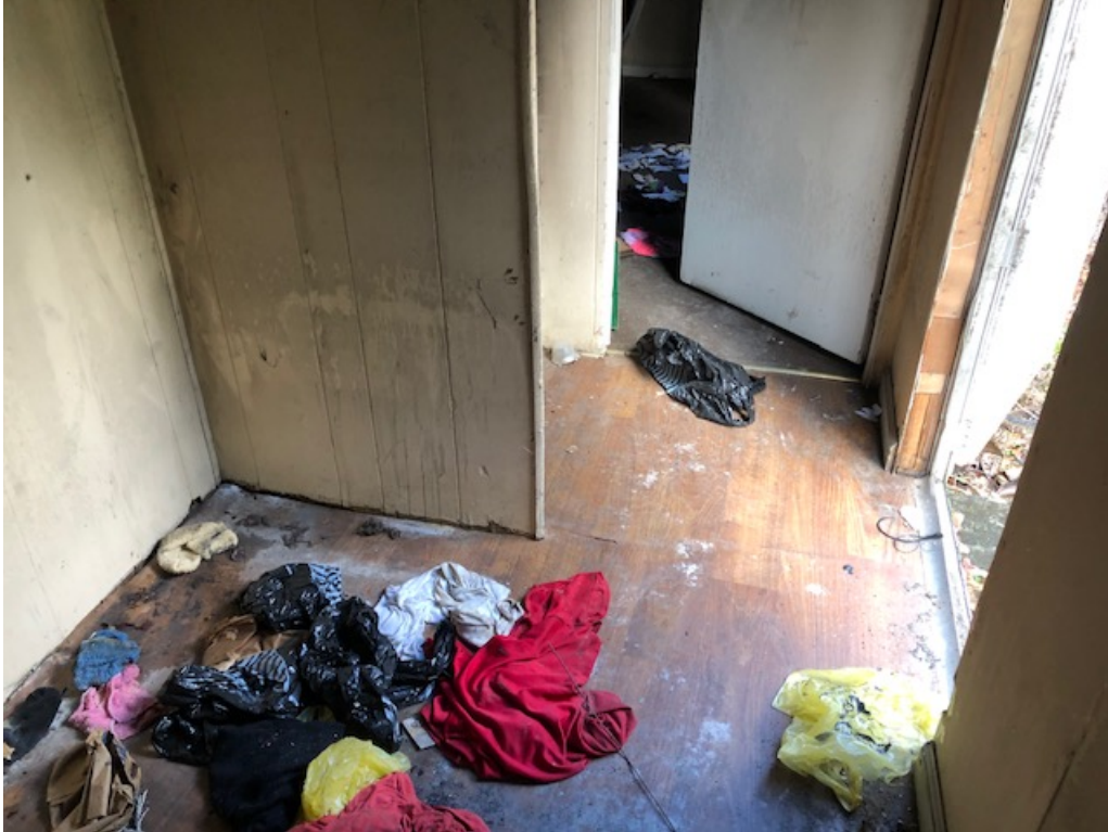
This photo depicts another view of the flooring in the hallway.