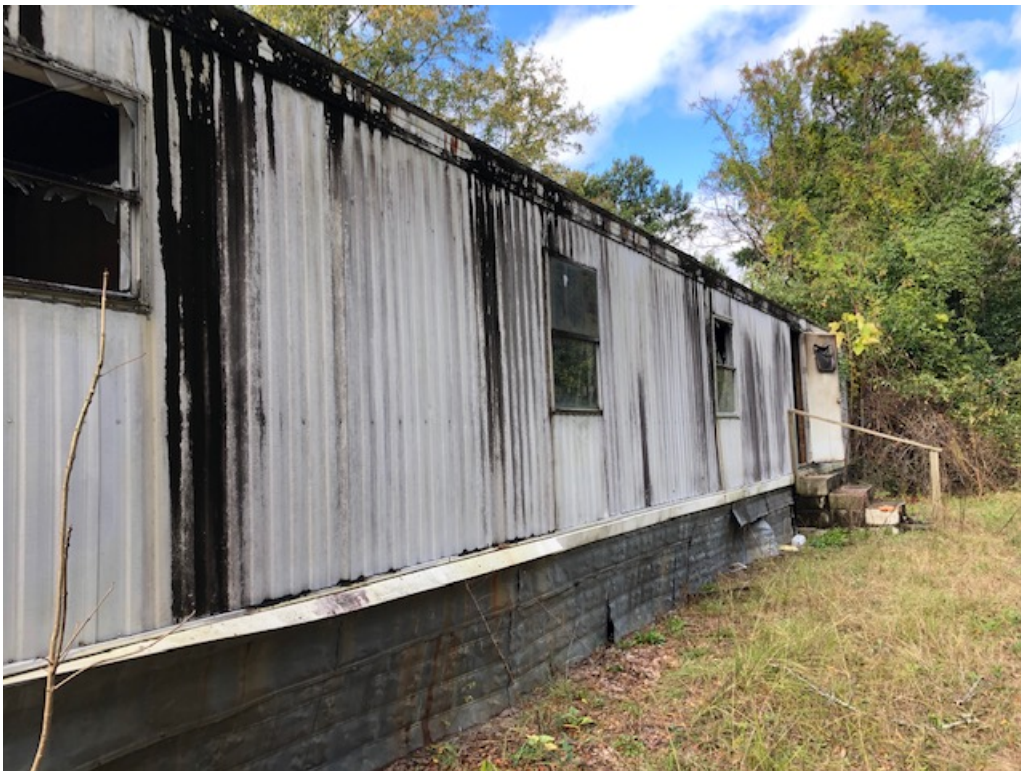
This photo depicts another view of the exterior of the residence.