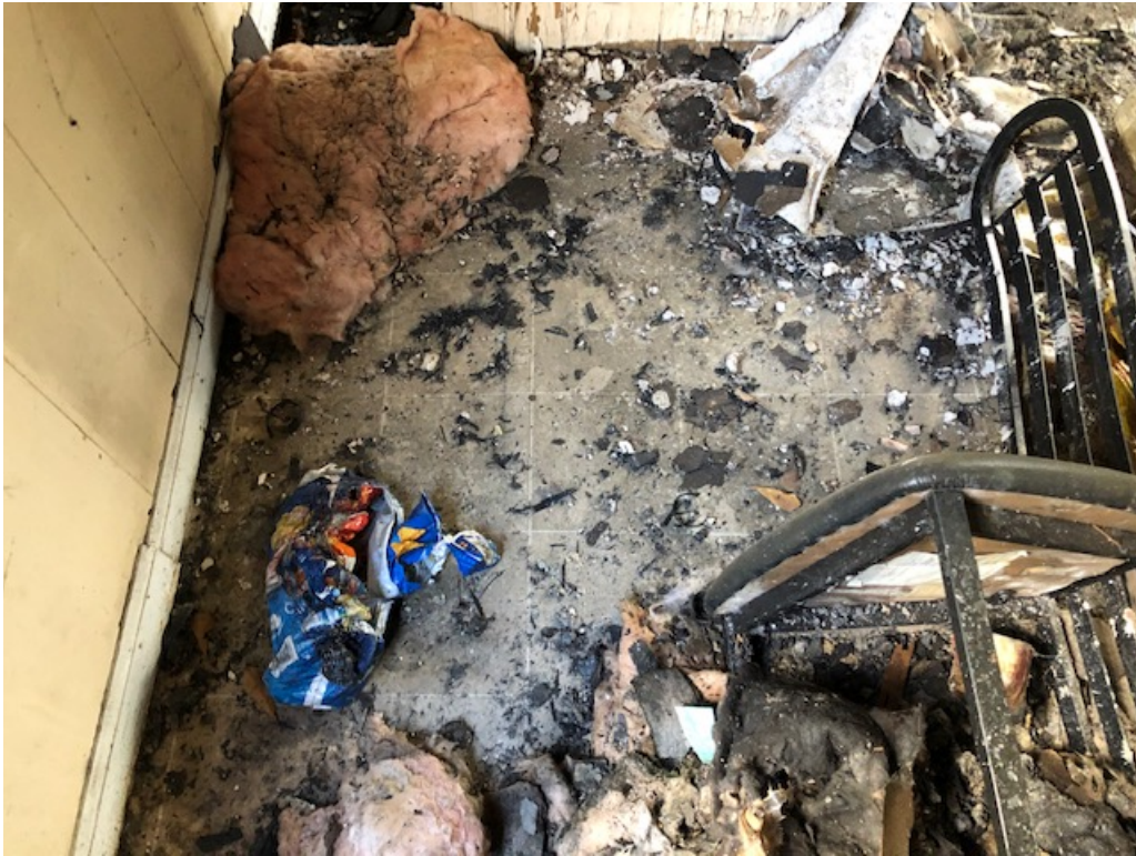
This photo depicts another layer of sheet flooring.