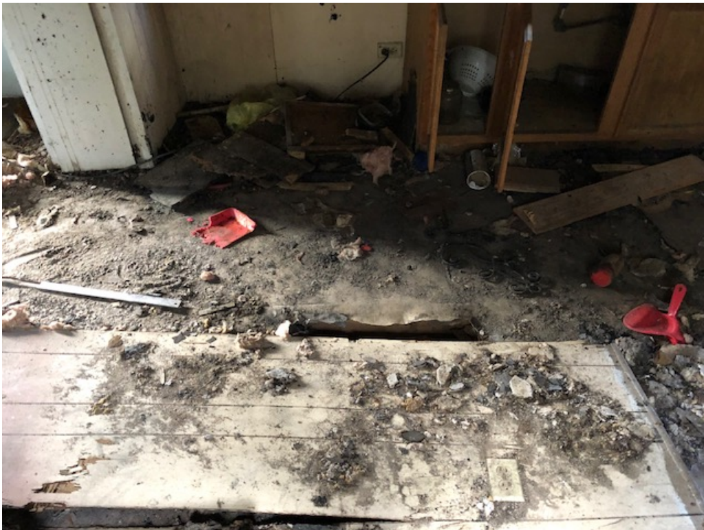
This photo depicts the sheet flooring sampled from the kitchen.