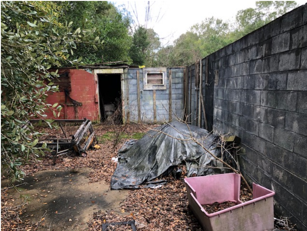
This photo depicts the inside of the residence.