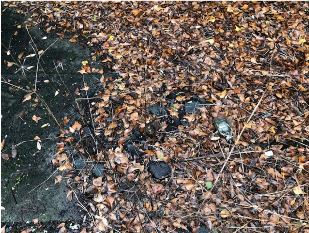
This photo depicts remnant roofing material inside the residence.