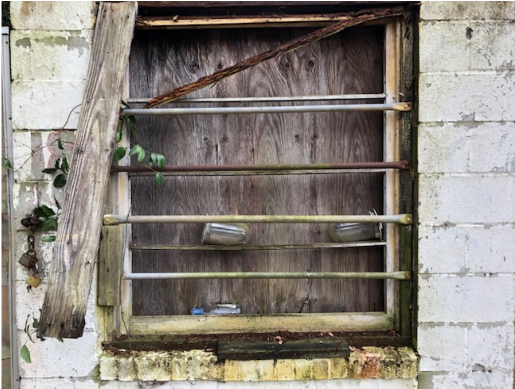
This photo depicts the window glaze sampled from the windows.