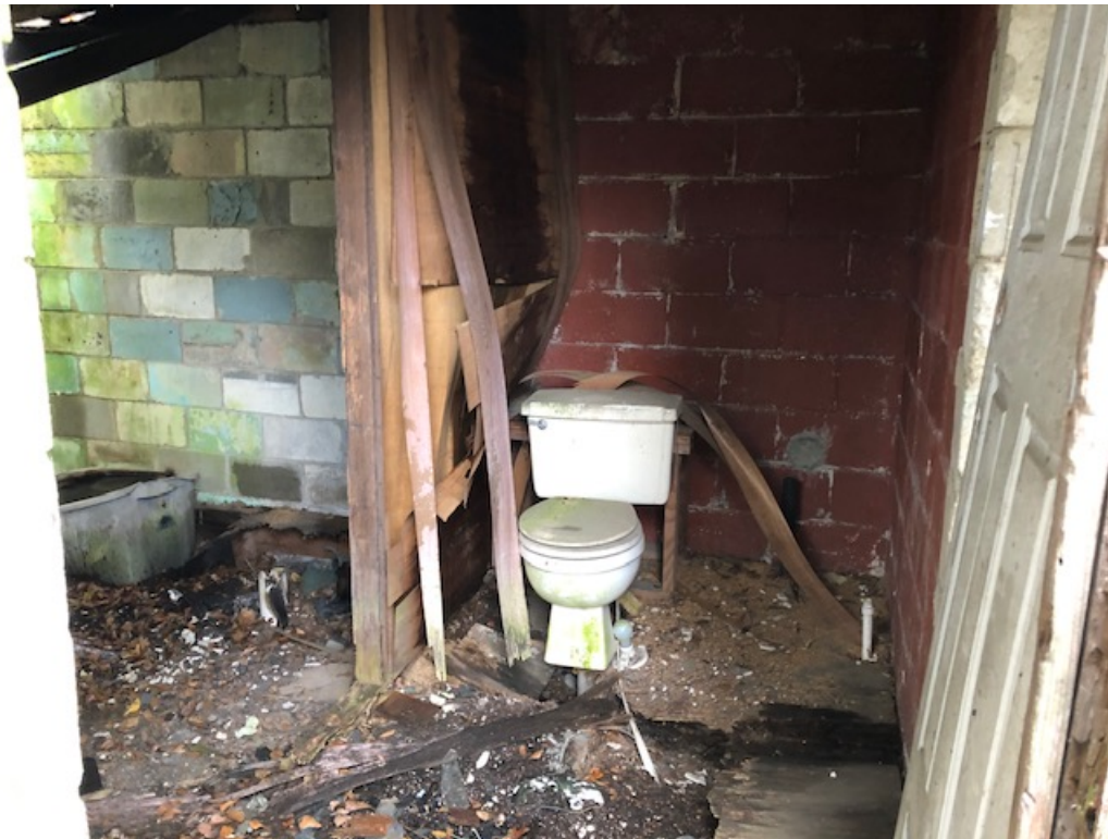
This photo depicts a bathroom at the back of the residence.