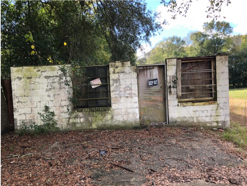
This photo depicts the front of the residence.