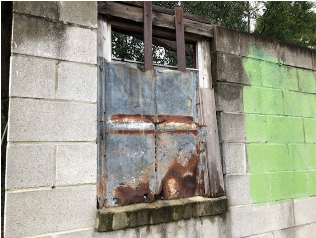
This photo depicts another view of a window.