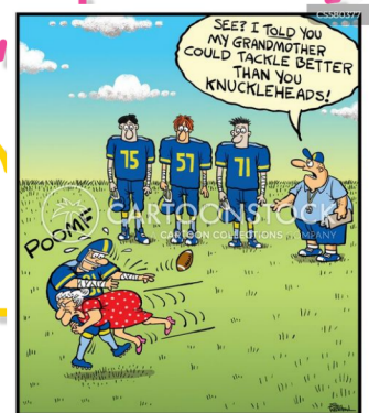
SEE? I TOLD YOU MY GRANDMOTHER COULD TACKLE BETTER THAN YOU KNUCKLEHEADS!