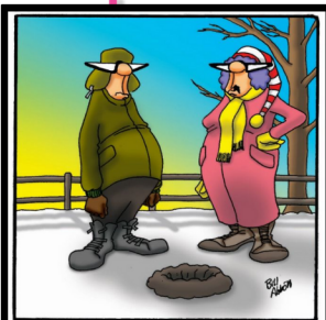
"The groundhog saw your shadow, idiot. This'll probably bring on the Ice Age."