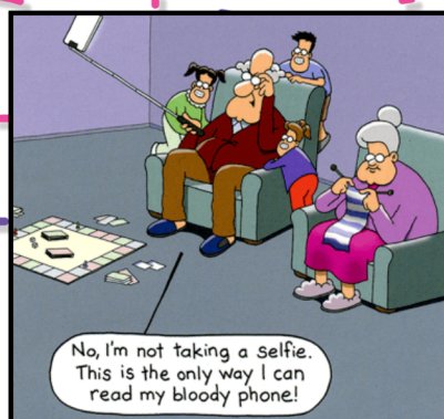
No, I'm not taking a selfie. This is the only way I can read my bloody phone!